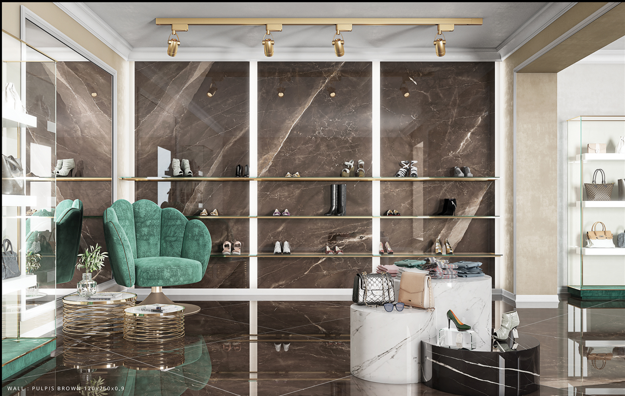
WALL : PULPIS BROWN 120x260x0,9