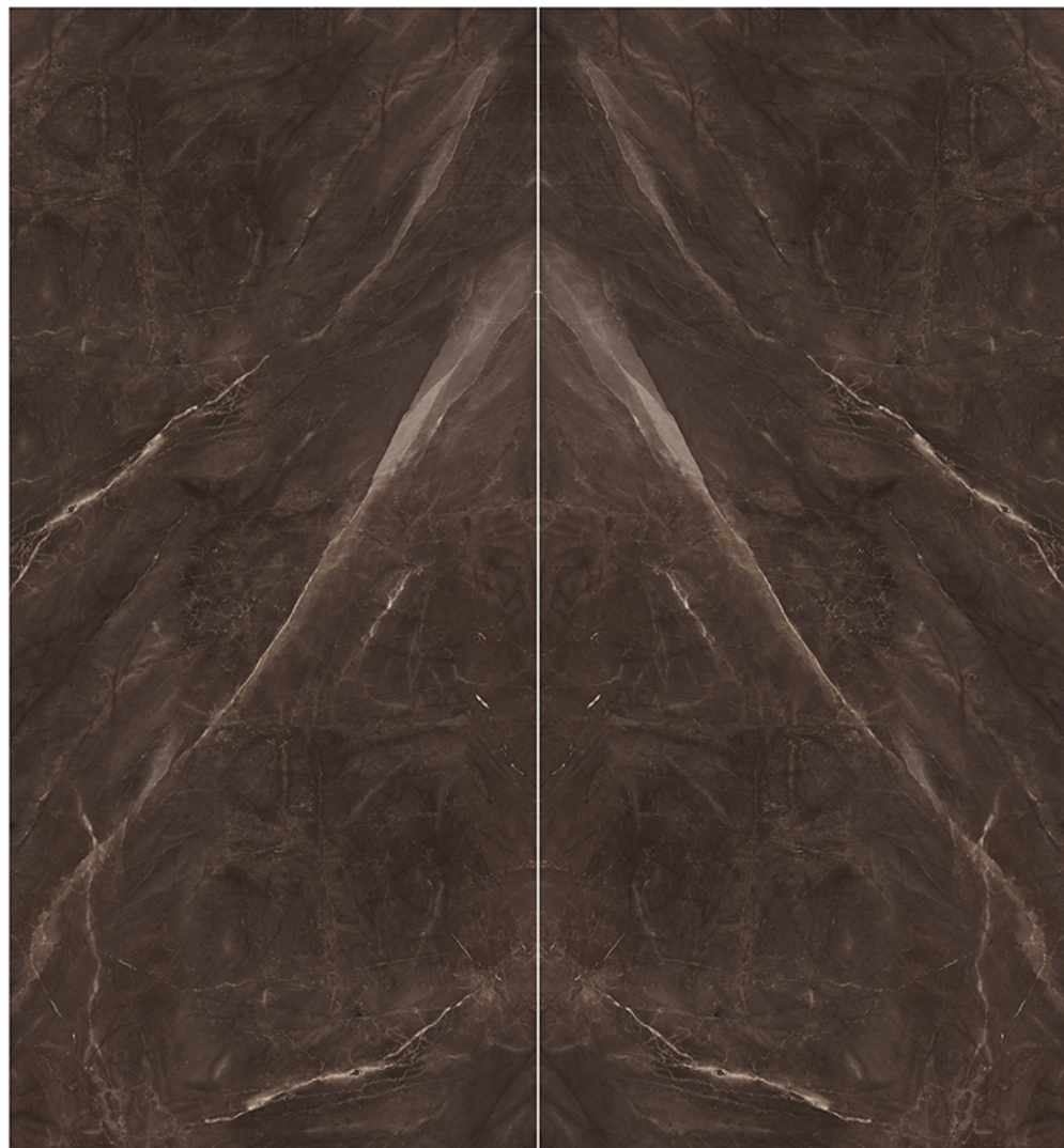
PORCELAIN STONEWARE - NORMAL BODY